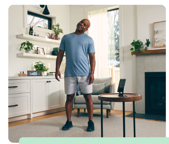
Exercise therapy made easy

Take a short online questionnaire following the link below, telling us about your pain. No referral or diagnosis needed from a doctor.